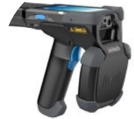
UHF/RIFD version with 2D imager.