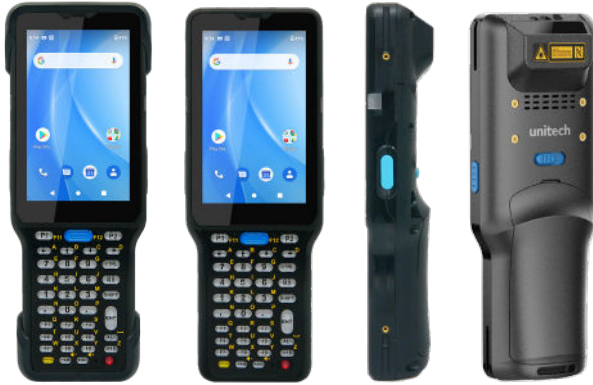
With bumper 2.4m drop-resistant