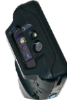
Standard version N6703 imager or N3603 imager, depending on key-configuration.