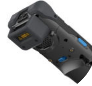
Long range version EX30 Near-Far imager 20m reading distance*.