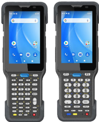
Function Numeric 38-key