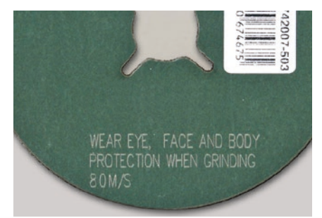
Writing on sanding discs