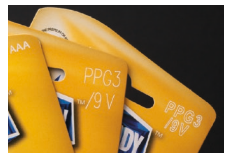
Writing on card