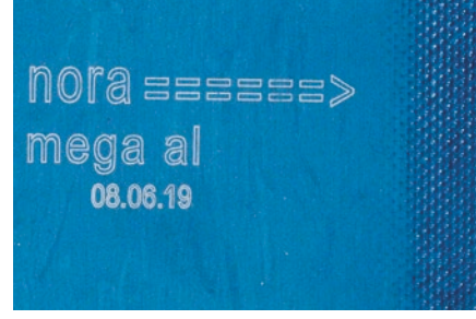
Marking of composite materials