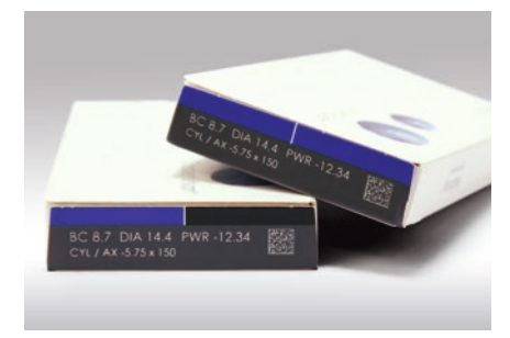
Coding and marking of packaging through color removal