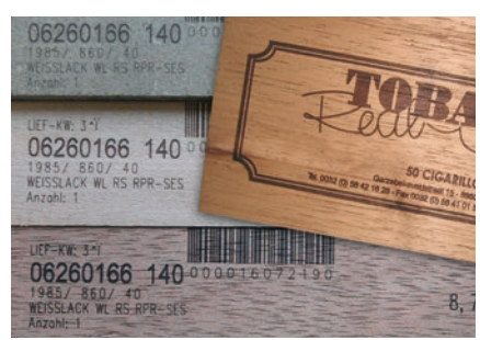
Marking of wooden profiles