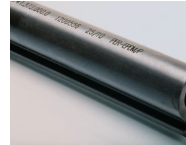
Marking of rubber profiles