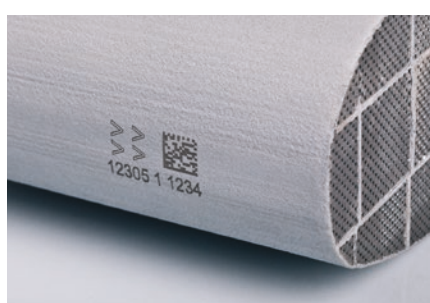
2D Code marking of soot particle filters