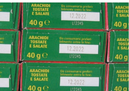
Writing on cardboard boxes