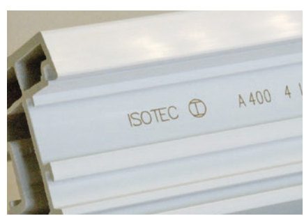
Marking of plastics