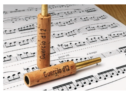
Writing on cork