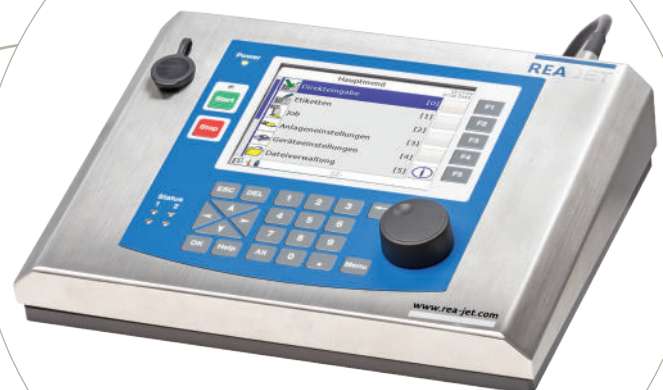
REA JET Universal Controller