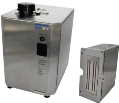
Ink supply unit With print head