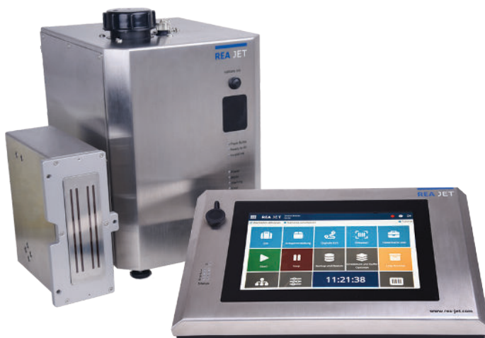
REA JET UP with Touch Controller and ink supply unit

The rugged and at the same time compact device design allows for easy integration into any product line. It also makes it suitable for Industry 4.0, which is a matter of course for REA JET.