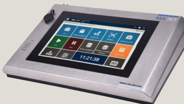
REA JET Universal Controller Touch