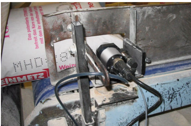
Marking of paper bags