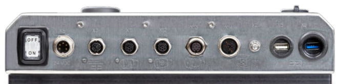
Rear view REA JET DOD 2.0 Control Terminal – port panel