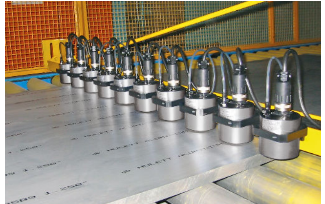
Marking of aluminum plates