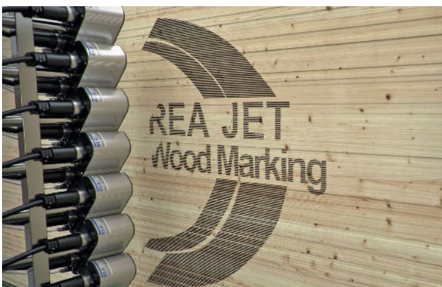
Large marking of logos on stacked boards