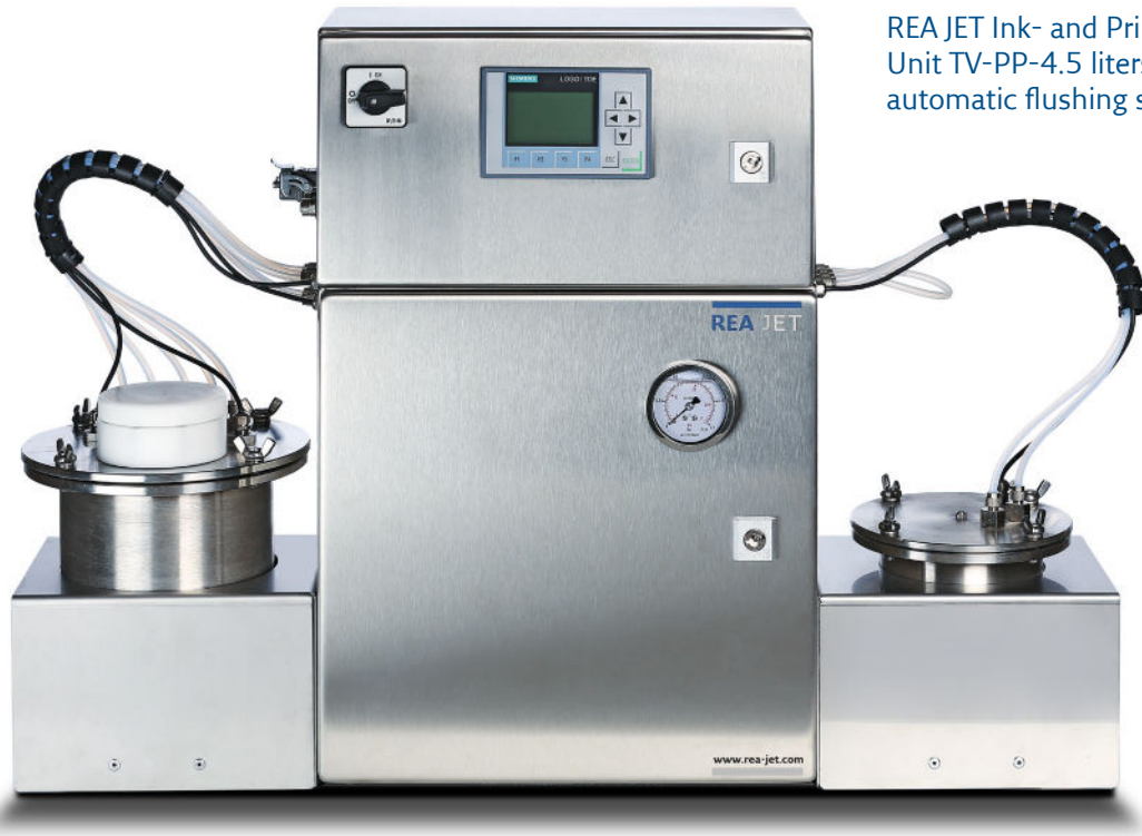
REA JET Ink- and Primer Supply Unit TV-PP-4.5 liters (AFS) with automatic flushing system

REA JET offers various ink and primer supplies - the right solution for every customer requirement.