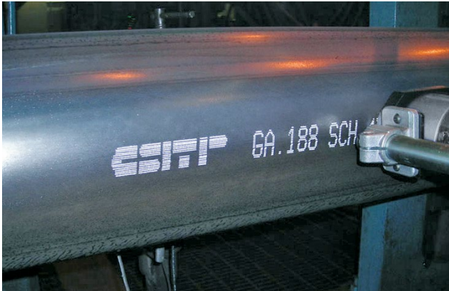
Coding and marking of pipes (steel, plastic etc.)