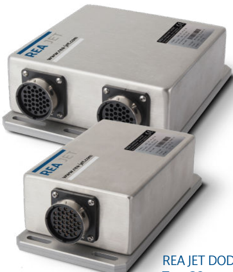
REA JET DOD 2.0 – Print Head Controller Units Top: 32 nozzles, bottom: 7/16 nozzles