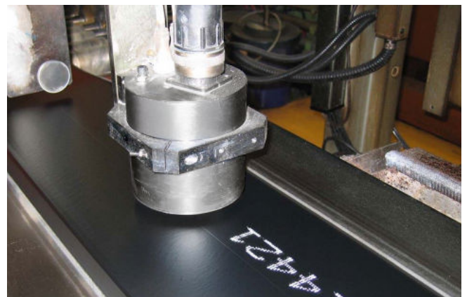
Marking of tread on raw rubber