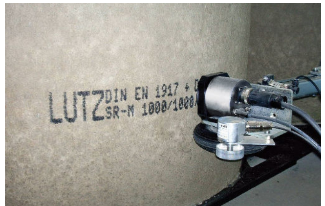
Marking of concrete pipes